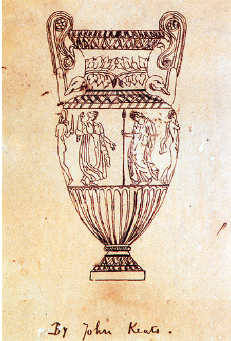
A Grecian Urn

You have just purchased an expensive Grecian urn and asked the dealer to ship it to your house. He picks up a hammer, shatters it into pieces, and explains that he will send one piece a day in an envelope for the next year. You object; he says "don't worry, I'll make sure that you get every single piece, and the markings are clear, so you'll be able to glue them all back together. I've got it covered." Absurd, no? But this is the way many school systems require teachers to deliver mathematics to their students; one piece (i.e. one standard) at a time. They promise their customers (the taxpayers) that by the end of the year they will have "covered" the standards.